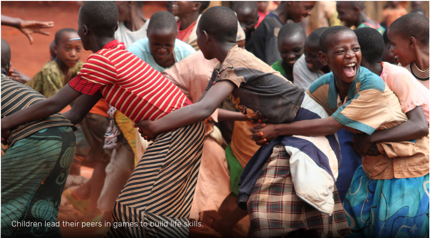
Children lead their peers in games to build life skills.

In 2019, Right To Play transformed the lives of 2.35 million children in 15 countries around the world, working in collaboration with teachers, governments, communities, and parents.